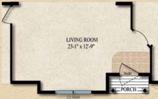
OPTIONAL BUMP-OUT & EXTENDED PORCH WITH SHED ROOF OVER PORCH

Flex Bath Options A, B, C, D & E available (See Page #31)