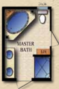
OPTIONAL MASTER BATH w/ CORNER DECK TUB & 48" SHOWER