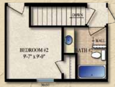
OPTIONAL BASEMENT STAIRWELL MOD ONLY