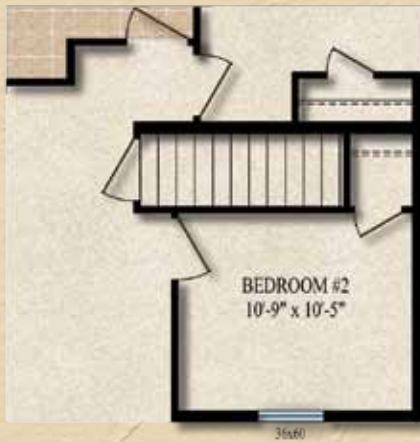
OPTIONAL BASEMENT STAIRWELL MOD ONLY