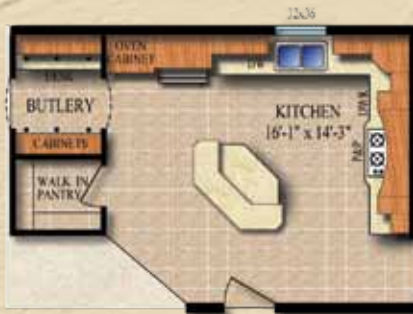
SIGNATURE KITCHEN OPTION WITH SURFACE MOUNT RANGE, EYE LEVEL OVEN & BUILT IN MICROWAVE