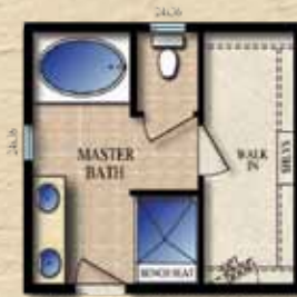
DELUXE MASTER BATH w/ 60x43 SEAT SHOWER & DECK TUB