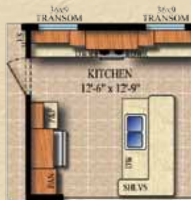
TRANSOM KITCHEN OPTION