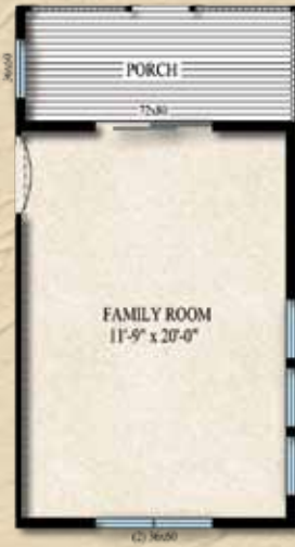
14' FAMILY ROOM & PORCH OPTION