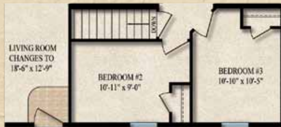
OPTIONAL BASEMENT STAIRWELL MOD ONLY