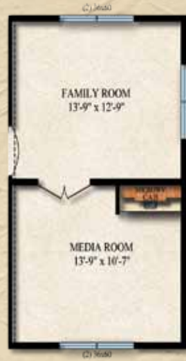
14' FAMILY ROOM & MEDIA ROOM OPTION