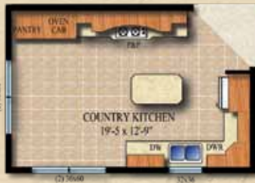
SIGNATURE KITCHEN OPTION WITH SURFACE COOK-TOP, BUILT IN OVEN & MICROWAVE

OPTIONAL 2nd EXTENSION W/ COTTAGE HIP OPTION