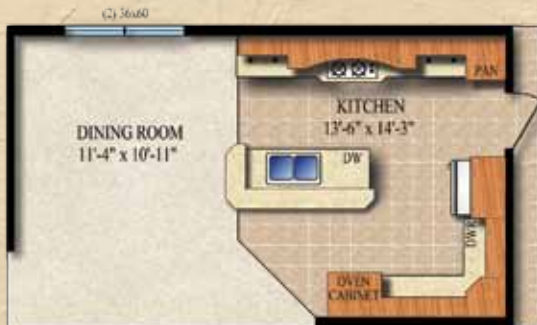
SIGNATURE KITCHEN WITH . SURFACE COOK-TOP, BUILT-IN OVEN & MICROWAVE