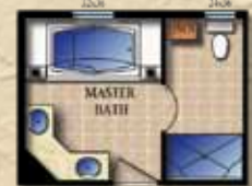
DELUXE MASTER BATH w/ 72" SOAKER TUB & 60" SHOWER