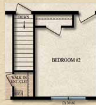
BASEMENT STAIRWELL OPTION MOD ONLY