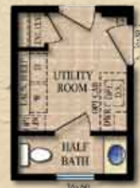
OPTIONAL HALF-BATH IN UTILITY ROOM WITH FURNACE & WATER HEATER OMITTED OR RELOCATED TO LIKE STAIRWELL OPTION (AVAILABLE IN CRAWL SPACE SET HOMES ONLY)