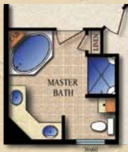
DELUXE MASTER BATH OPTION w/ DECK TUB AND 48" SHOWER