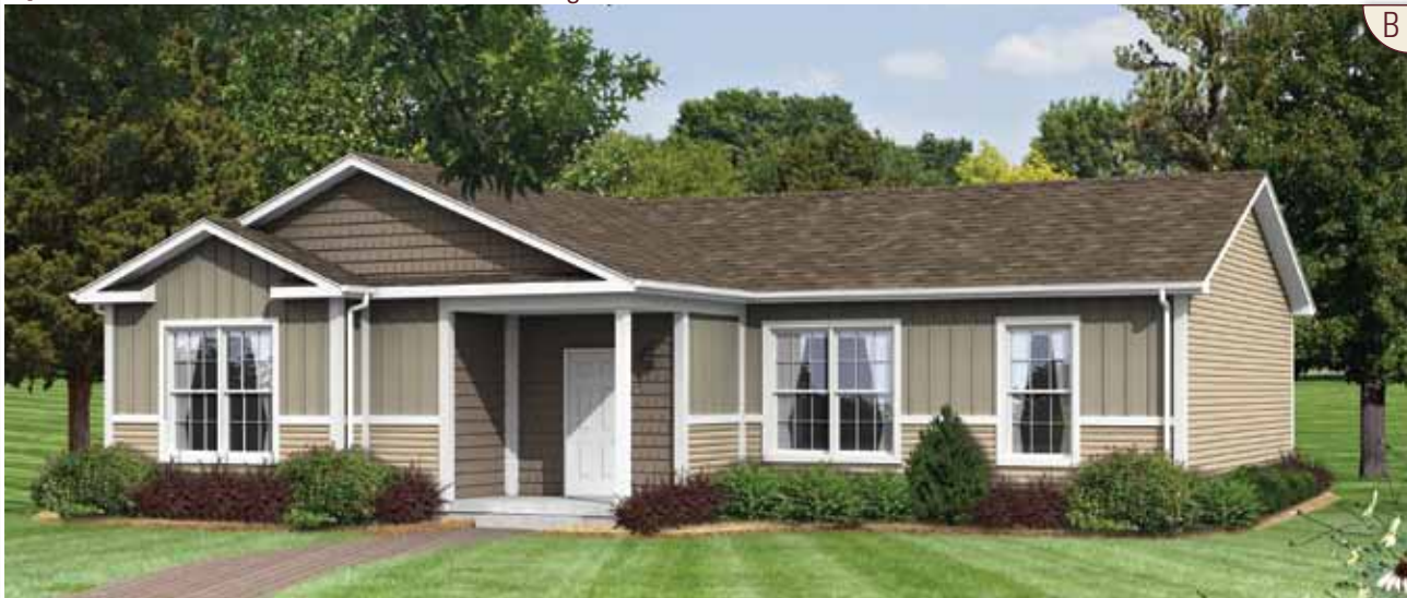
7/12 Roof Pitch Craftsman Color Packages