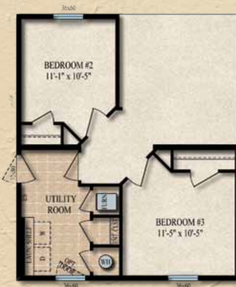
END ENTRY OPTION