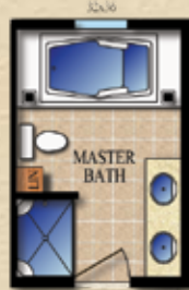
FLEX BATH OPTION "B" WITH A 72" SOAKER TUB & 48" SHOWER