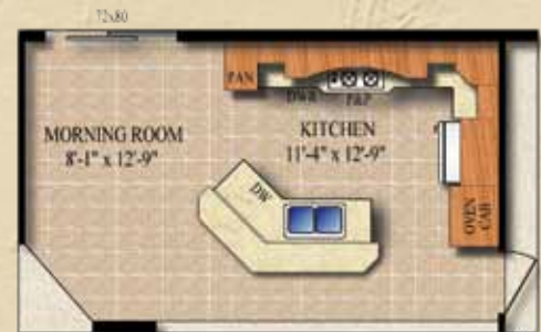
SIGNATURE KITCHEN WITH SURFACE COOK-TOP, BUILT-IN OVEN & MICROWAVE