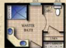
OPTIONAL MASTER BATH w/ 60x33 SEAT SHOWER