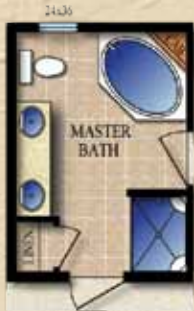
DELUXE MASTER BATH OPTION