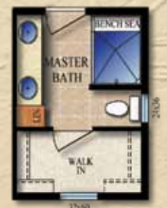
OPTIONAL MASTER BATH w/ 60x43 SEAT SHOWER