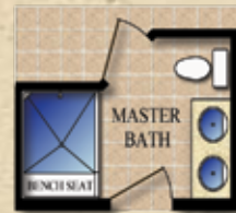
MASTER BATH OPTION w/ 60x43 SEAT SHOWER