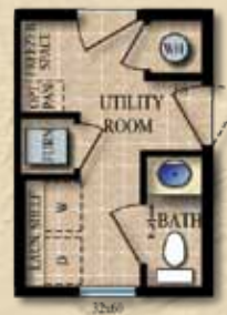
OPTIONAL 1/2 BATH