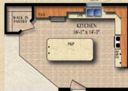
DELUXE ISLAND OPTION (SHOWN WITH THE STD KITCHEN ALSO AVAILABLE IN THE SIGNATURE KITCHEN)