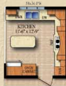
SIGNATURE KITCHEN WITH SURFACE COOK-TOP, BUILT-IN OVEN & MICROWAVE