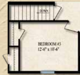
OPTIONAL BASEMENT STAIRWELL MOO ONLY