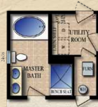
DELUXE MASTER BATH OPTION w/ DECK TUB & 60x43 SEAT SHOWER