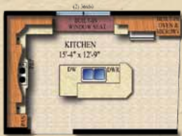
SIGNATURE KITCHEN WITH . SURFACE COOK-TOP, BUILT-IN OVEN & MICROWAVE