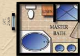
DELUXE MASTER BATH OPTION