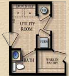
OPTIONAL 1/2 BATH IN UTILITY ROOM