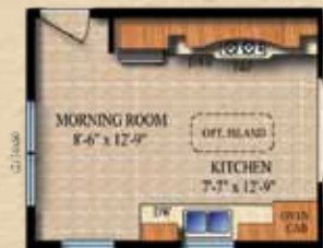
SIGNATURE KITCHEN OPTION WITH SURFACE COOK-TOP, BUILT-IN OVEN & MICROWAVE