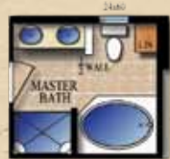
DELUXE MASTER BATH OPTION