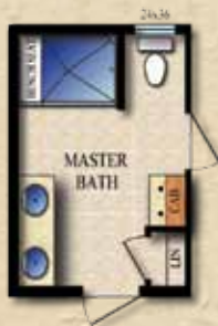
OPTIONAL MASTER BATH w/ 60x43 SEAT SHOWER