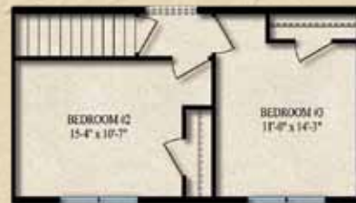
BASEMENT STAIRWELL OPTION MUD ONLY