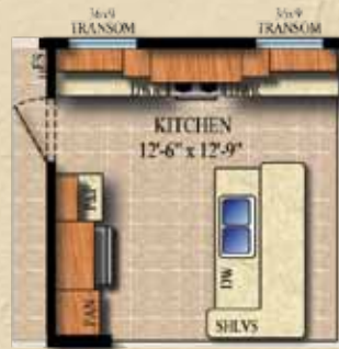
TRANSOM KITCHEN OPTION