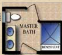
MASTER BATH OPTION w/ 60x43 SEAT SHOWER