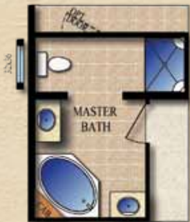
DELUXE MASTER BATH w/ CORNER DECK TUB & 48" SHOWER