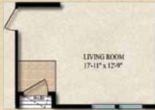
OPTIONAL RECESSED ENTRY