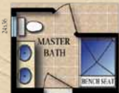
MASTER BATH OPTION w/ 60x43 SEAT SHOWER