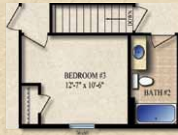
OPTIONAL BASEMENT STAIRWELL MOOD ONLY