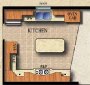
SIGNATURE KITCHEN WITH SURFACE COOK-TOP, BUILT-IN OVEN & MICROWAVE