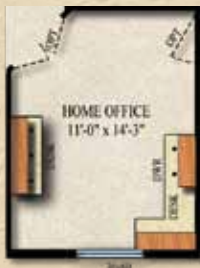
HOME OFFICE OPTION (REPLACES BEDROOM #4)

Flex Bath Options A, B, C, D & E available (See Page #31)