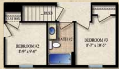
OPTIONAL BASEMENT STAIRWELL