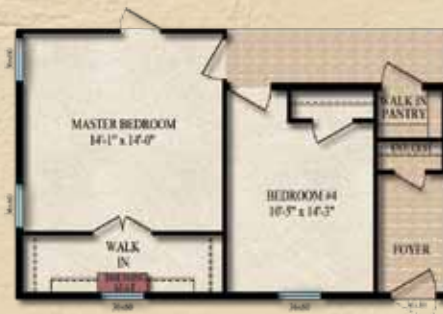
BEDROOM 4 OPTION (REPLACES WALK-IN CLOSET)