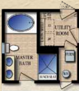
DELUXE MASTER BATH OPTION w/ DECK TUB & 60x43 SEAT SHOWER