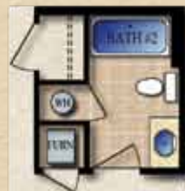
FURNACE & WATER HEATER LOCATION WITH STAIRWELL OPTION