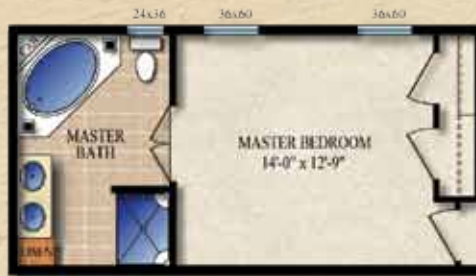
DELUXE MASTER BATH W/ CORNER DECK TUB & 60" SHOWER