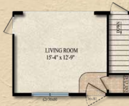
BASEMENT STAIRWELL OPTION MOD ONLY