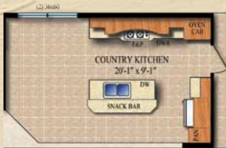
SIGNATURE KITCHEN WITH SURFACE COOK-TOP, BUILT-IN OVEN & MICROWAVE