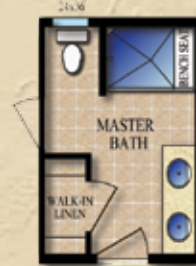
FLEX BATH OPTION "C" WITH A 60x43 SEAT SHOWER