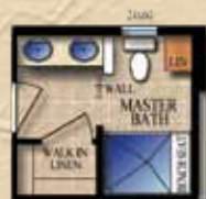
MASTER BATH OPTION w/ SEATED SHOWER