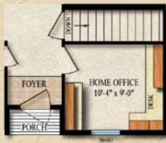
OPTIONAL BASEMENT STAIRWELL MOD ONLY