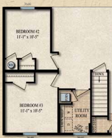
OPTIONAL BASEMENT STAIRWELL MOD ONLY