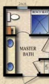
OPTIONAL MASTER BATH w/ 60x43 SEAT SHOWER