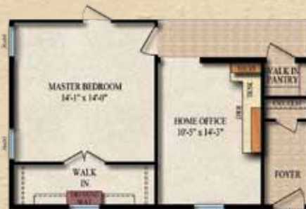
HOME OFFICE OPTION (REPLACES WALK-IN CLOSET)