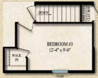
OPTIONAL BASEMENT STAIRWELL MOD ONLY