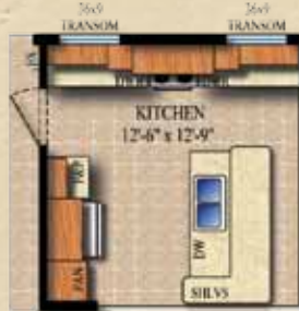
TRANSOM KITCHEN OPTION