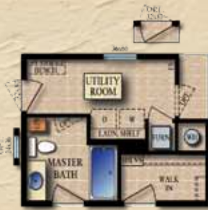
OPTIONAL END ENTRY