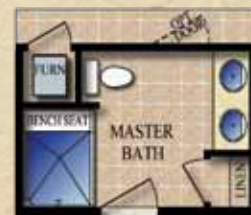
OPTIONAL MASTER BATH w/ 60x43 SEAT SHOWER