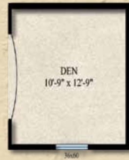
OPTIONAL DEN (REPLACES BEDROOM #2)