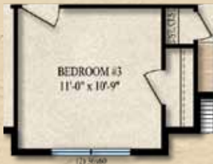
BEDROOM #3 WITH 20" BUMP-OUT OPTION