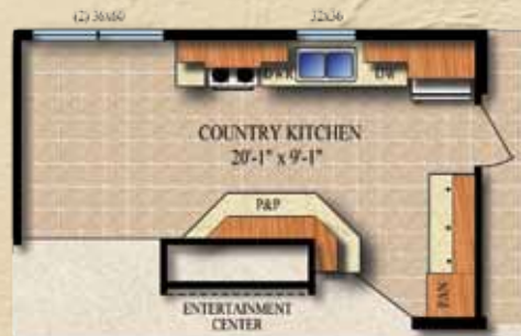
OPTIONAL ENTERTAINMENT CENTER