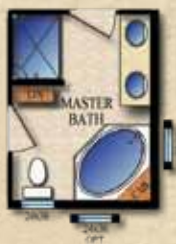
OPTIONAL MASTER BATH w/ CORNER DECK TUB & 48" SHOWER