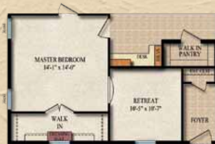
MASTER BEDROOM RETREAT OPTION (REPLACES WALK-IN CLOSET)