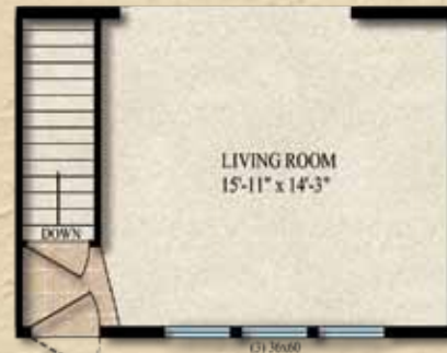
OPTIONAL BASEMENT STAIRWELL MOD ONLY