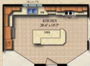
SIGNATURE KITCHEN WITH W/SURFACE COOK-TOP, BUILT-IN OVEN & MICROWAVE