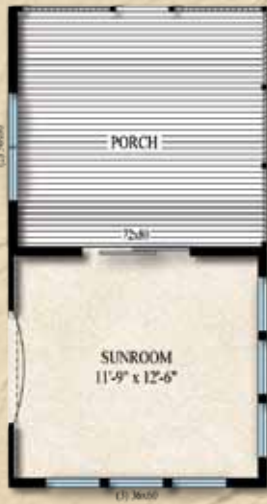
14' SUNROOM & PORCH ROOM