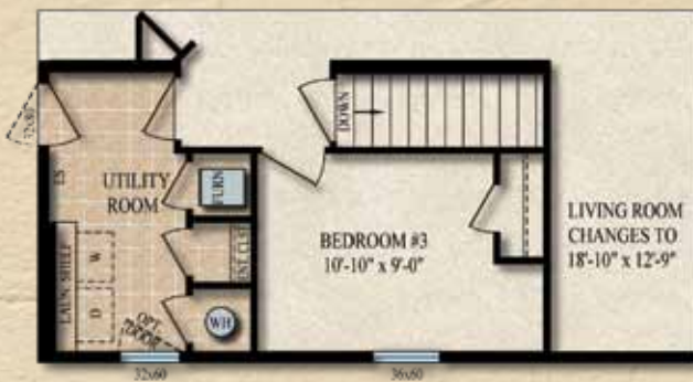
OPTIONAL BASEMENT STAIRWELL w/ END ENTRY MOD ONLY