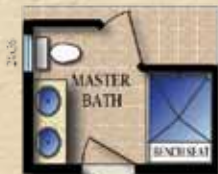
MASTER BATH OPTION w/ 60x43 SEAT SHOWER