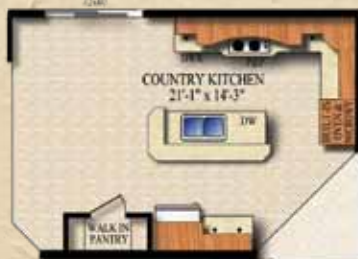
SIGNATURE KITCHEN WITH SURFACE COOK-TOP, BUILT-IN OVEN & MICROWAVE