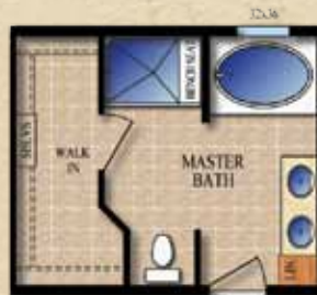
FLEX BATH OPTION "E" WITH A 60" DECK TUB & 60x43 SEAT SHOWER

Note: Orientation of room may change depending on floor plan layout.