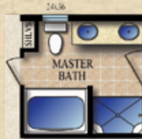
DELUXE MASTER BATH OPTION w/ GARDEN TUB & 36" SHOWER