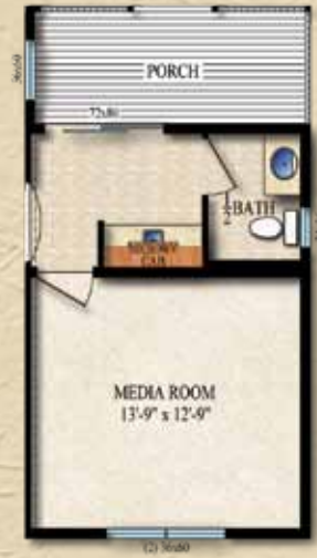
14' MEDIA ROOM OPTION w/ HALF BATH AND PORCH

Note: Orientation of room may change depending on floor plan layout.