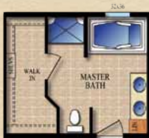
FLEX BATH OPTION "D" WITH A 72" SOAKER TUB & 48" SHOWER