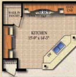
SIGNATURE KITCHEN OPTION WITH SURFACE COOK-TOP, BUILT IN OVEN & MICROWAVE

Flex Bath Options A, B, C, D & E available (See Page #31)