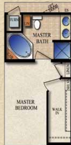
OPTIONAL MASTER BATH w/ CORNER DECK TUB & 36" SHOWER