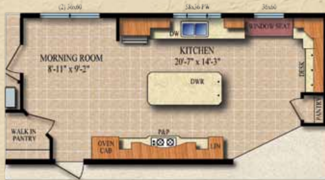
SIGNATURE KITCHEN OPTION WITH SURFACE COOK-TOP, BUILT IN OVEN & MICROWAVE