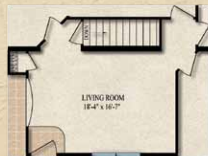
OPTIONAL BASEMENT STAIRWELL MOD ONLY