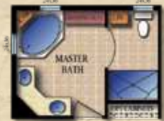
DELUXE MASTER BATH w/ CORNER DECK TUB & 60" SHOWER