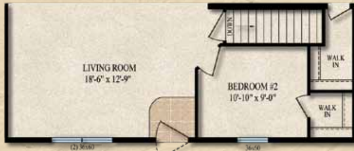
BASEMENT STAIRWELL OPTION MOD ONLY