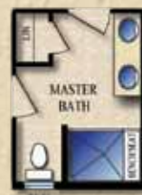
OPTIONAL MASTER BATH w/ 60x41 SEAT SHOWER