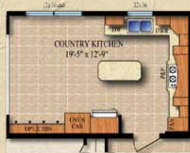
SIGNATURE KITCHEN OPTION WITH SURFACE COOK-TOP, BUILT IN OVEN & MICROWAVE