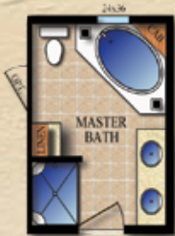
FLEX BATH OPTION "A" WITH A 60" CORNER TUB & 48" SHOWER