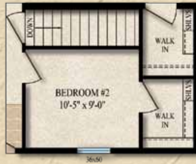
OPTIONAL BASEMENT STAIRWELL MOD ONLY