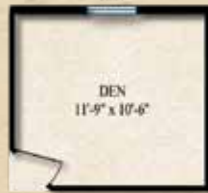
DEN OPTION (REPLACES RETREAT)