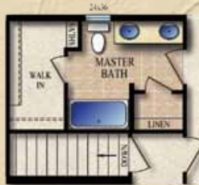
BASEMENT STAIRWELL OPTION MOD ONLY