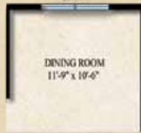
DINING ROOM OPTION (REPLACES RETREAT)