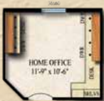
HOME OFFICE OPTION (REPLACES RETREAT)