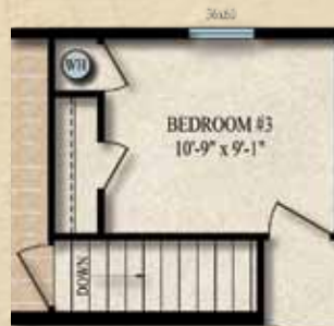
OPTIONAL BASEMENT STAIRWELL MOD ON1 V