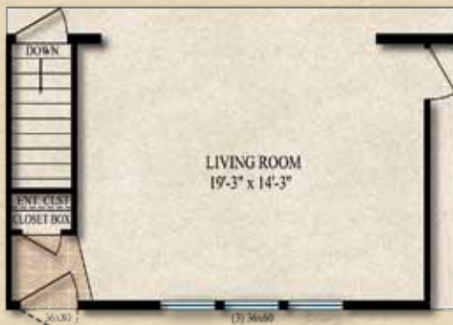
OPTIONAL BASEMENT STAIRWELL MOD ONLY