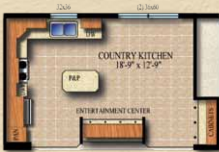
OPTIONAL KITCHEN WITH ENTERTAINMENT CENTER

Flex Bath Options A, B, C, D & E available (See Page #31)