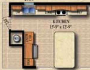
SIGNATURE KITCHEN WITH SURFACE COOK-TOP, BUILT-IN OVEN & MICROWAVE