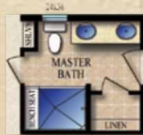
OPTIONAL MASTER BATH w/ 60x43 SEAT SHOWER