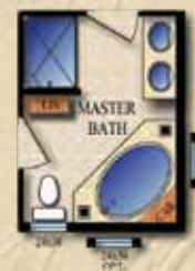
OPTIONAL LUXURY MASTER BATH w/ CORNER DECK TUB & 48" SHOWER