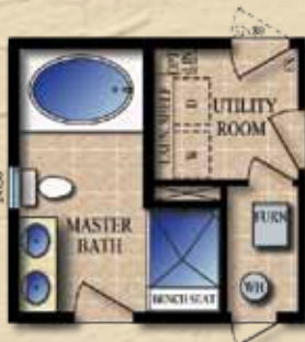
DELUXE MASTER BATH OPTION w/ DECK TUB & 60x43 SEAT SHOWER